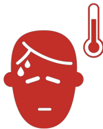
High Fever ( \geq 101^{\circ}\text{F} )